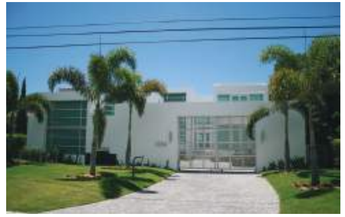
Custom Home in Miami, Florida