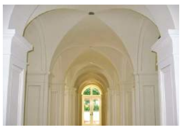
Groin vaults on a private residence, Miami, Florida

For a free estimate contact our Sales Department at (800) 203-9255. ■