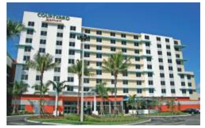
Miami Marriott Airport Complex for Suffolk