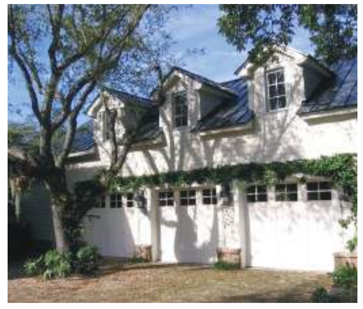
Private residence in Miami, Florida

Did you know Paramount has a custom home division? That's right! Only our best drywall and stucco crews are allowed to work on the custom homes we help build. Whether you are building a modest size home or a palatial estate, our custom home division shares your passion for excellence in customer service and craftsmanship that only your dream home deserves. We are a one stop shop for your metal framing and drywall systems as well as lath and plaster finishes. From circular walls, coffered or tray ceilings, curved soffits, barrel ceilings, groin vaults, arches, wall units, nitches, wall and ceiling textures, raised stucco bands, reveals, to simulated wood siding and more. We