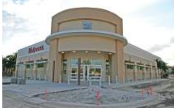
Walgreen's drugstore for Link