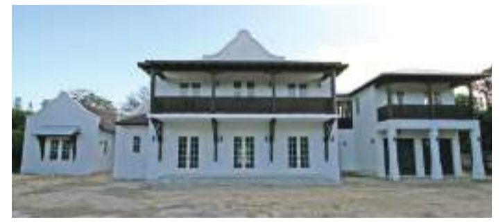
Custom Home, Miami, Florida