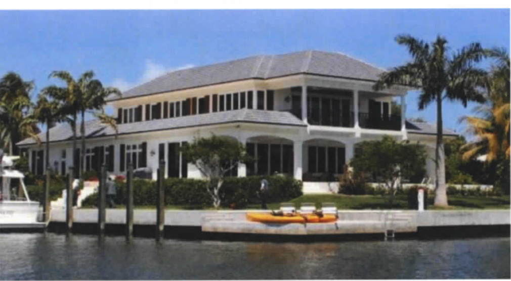
Private residence, Ocean Reef Club, Key Largo, Florida