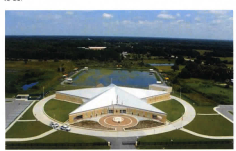
Florida Seminoles Veterans Building in Okeechobee, Florida for D.E. Murphy Constructors

We want to remind all of you that our estimating department has the capability of working with you on your negotiated Design/Build projects from conceptual drawings to permit drawings. ■