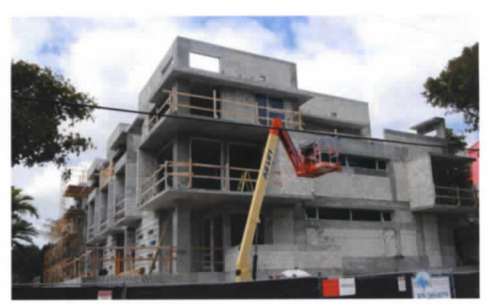
Multifamily Building on Miami's Brickell Avenue