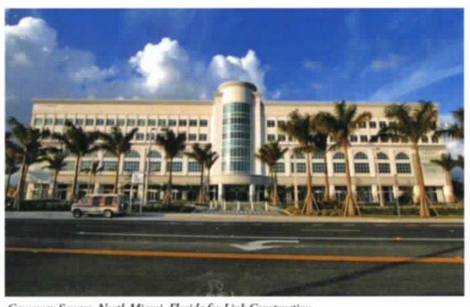
Causeway Square, North Miami, Florida for Link Construction