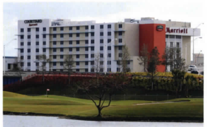
Miami Marriott Airport Complex for Suffolk