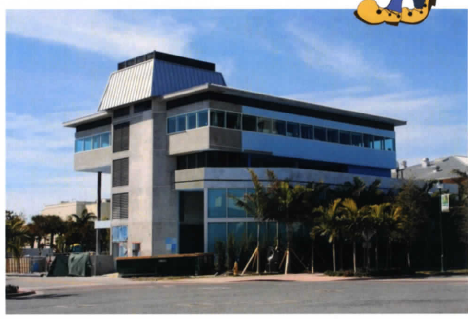
Dermatology and Surgical Center in Key Biscayne, Florida for Garmon Construction

Paramount is also busy doing work at multiple educational facilities in the South Florida area. At Florida International University, Tamiami Campus, our workers just started the drywall contract on the FIU SIPA Building for Suffolk Construction. This is our third project for Suffolk Construction during the last two years. At the University of Miami we continue to complete the drywall contract at the UM Alumni Center under the direction of Arellano Construction and work broke ground at the UM Wellness Center which Arellano just awarded to us.