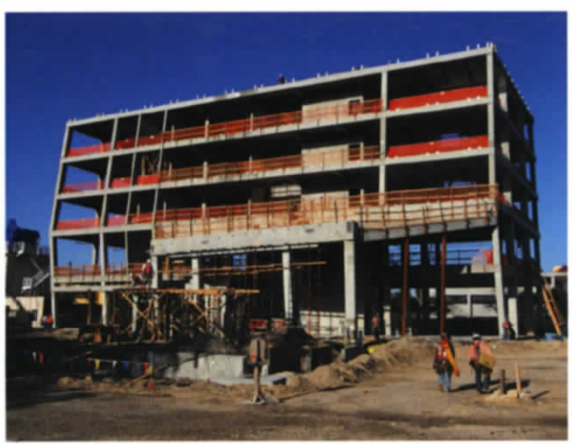
FIU-School of International and Public Affairs in Miami, Florida for Suffolk Constrution