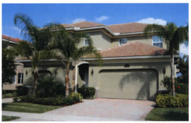
D. R. Horton's Cobblestone Creek, Boynton Beach, Florida