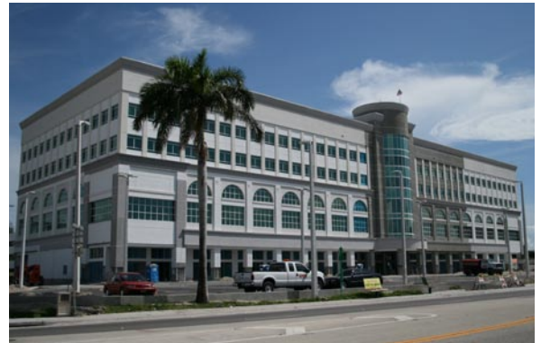
Causeway Square for Link

This is our second year working in multiple jobs with Arellano and we thank them for their business and continued support. We take this opportunity to congratulate Arellano on their recent and successful completion of their merger with OHL. ■