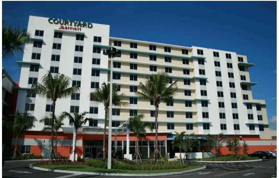
Miami Marriott Airport Complex for Suffolk

The last townhome 4-plex at Milano, a 186 unit residential development for Pulte Homes in Naples, Florida, was finished this summer and work