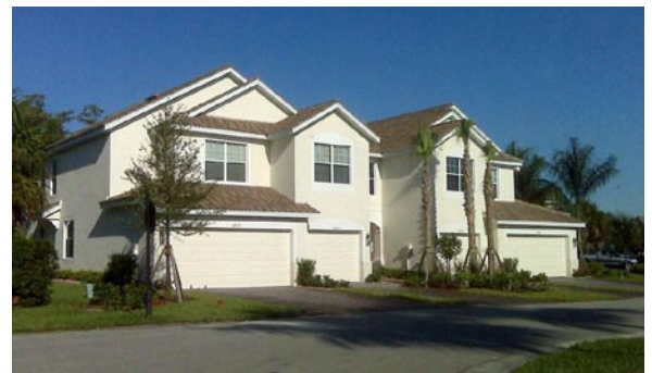
Milano for Pulte