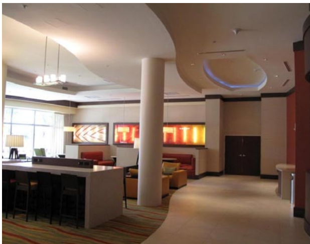
Miami Marriott Airport Complex Interiors

Corporate Office 7235 Corporate Center Dr., Bay D Miami, FL 33126 Phone (305) 828-4757 Fax (305) 828-4754