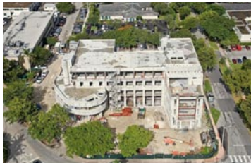
University of Miami Alumni Center for Arellano

began on the Metal Framing, Insulation and Drywall contract for the University of Miami Alumni Center in Coral Gables for Arellano Construction.