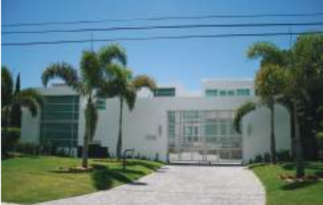
Custom Home in Miami, Florida