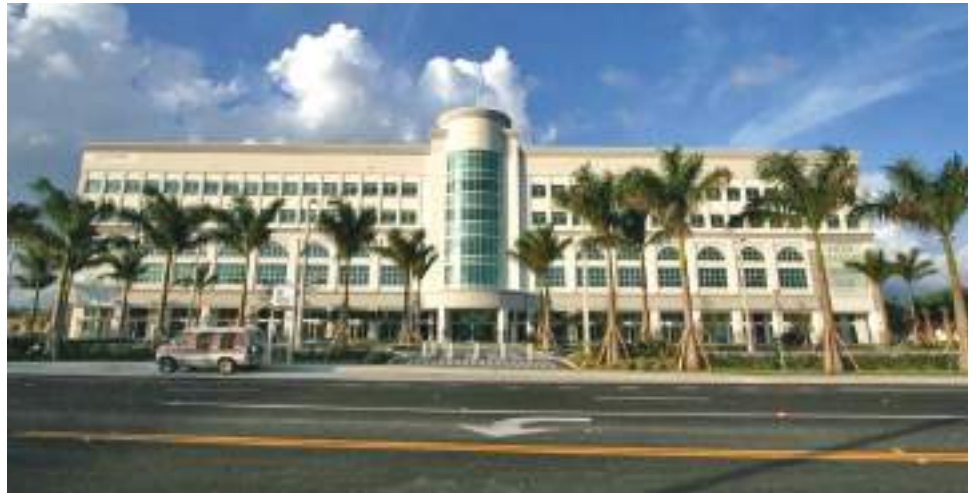
Causeway Square for Link

This fall we completed the drywall and stucco work for a new Suntrust Bank branch in Wilton