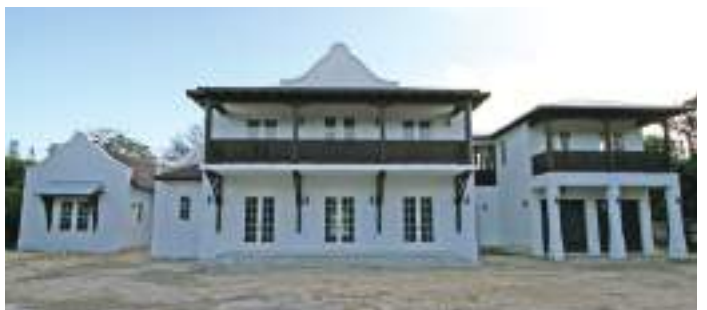
Custom Home, Miami, Florida