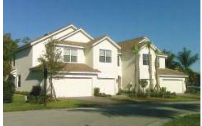
Milano for Pulte