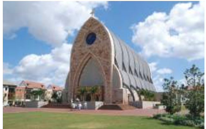
Ave Maria Oratory, Ave Maria, Florida for Suffolk-Kraft

Corporate Office 7235 Corporate Center Dr., Bay D Miami, FL 33126 Phone (305) 828-4757 Fax (305) 828-4754