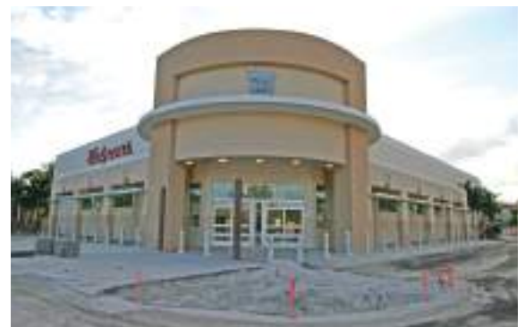
Walgreen's drugstore for Link