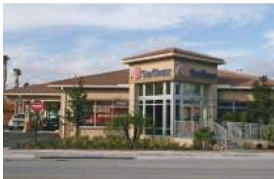
Suntrust Bank branch for New Urban Communities