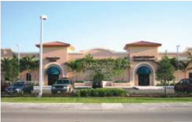
Baptist Medical Plaza for Arellano