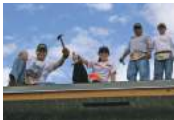
The Paramount team hard at work helping at Habitat for Humanity this holiday season.