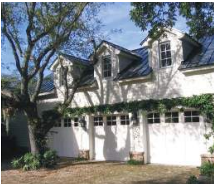
Private residence in Miami, Florida

For a free estimate contact our Sales Department at (800) 203-9255. ■