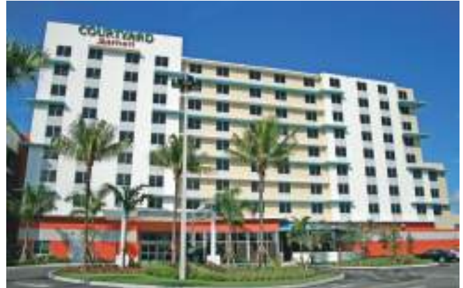
Miami Marriott Airport Complex for Suffolk