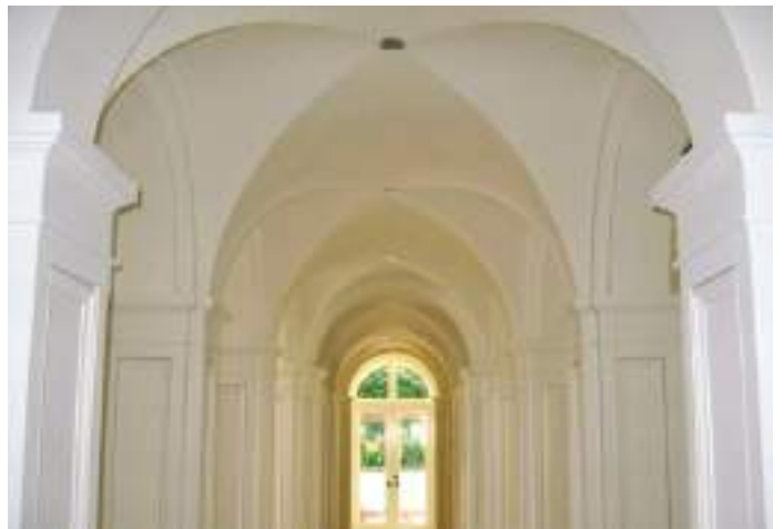
Groin vaults on a private residence, Miami, Florida