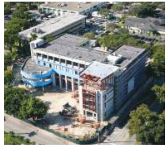
University of Miami Alumni Center for Arellano

Manors, Florida for New Urban Communities and we started the drywall contract of a Walgreen's drugstore in North Miami for Link Construction Group. New Urban has been a loyal client of Paramount giving us substantial work for many years. At Paramount we will eagerly do the big jobs for our clients and we are enthusiastically committed to complete their smaller jobs as well. Remember, customer service and your complete satisfaction are our priorities. ■